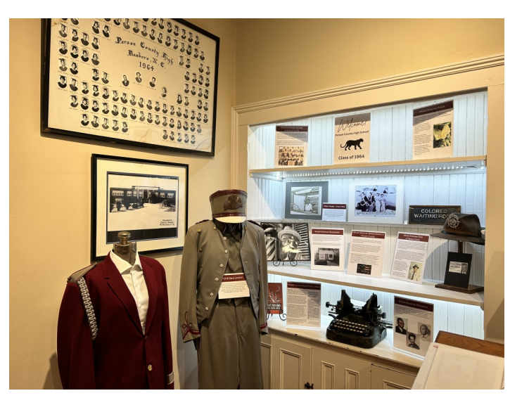
African American exhibition at the Person County Museum of History