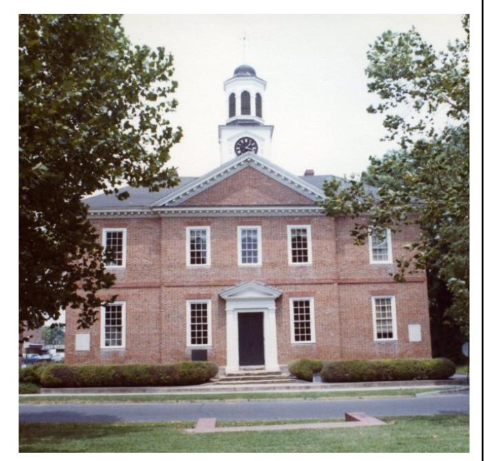
Chowan County Courthouse, Edenton, July 27, 1978, <u>PhC.13.22</u>

The grant will fund a new, historically accurate roof that will protect this national treasure for the future while also providing a stable interior environment to safeguard the structure and the colonial-era artifacts inside. The replacement of the roof also ensures that the 1767 Chowan County Courthouse continues to serve as an active community hub.