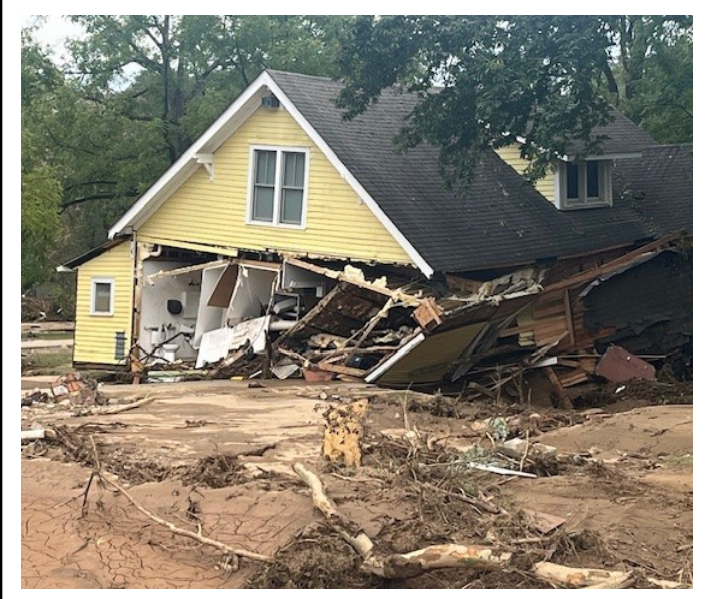
The Mauney House at Mountain Gateway Muse um in Old Fort included staff offices and artifact collections storage. Flooding of nearby Mill Creek during Hurricane Helene caused its collapse.

Flood recovery activities have taken place across DNCR's eighteen western sites, including Mountain Gateway Museum, one of the hardest hit by flooding. In addition to clearing downed trees, repairing building damages, and functioning for some time without power or water, DNCR staff in the region helped with community disaster response. State Historic Preservation Office staff continue to provide restoration technical support. Over 150 state parks staff assisted in community disaster response, including work as first responders and law enforcement officers. Of the thirteen state parks with some damage, all but three had reopened at least partially by mid-November. Chimney Rock, Mount Mitchell, and South Mountains state parks remain closed.